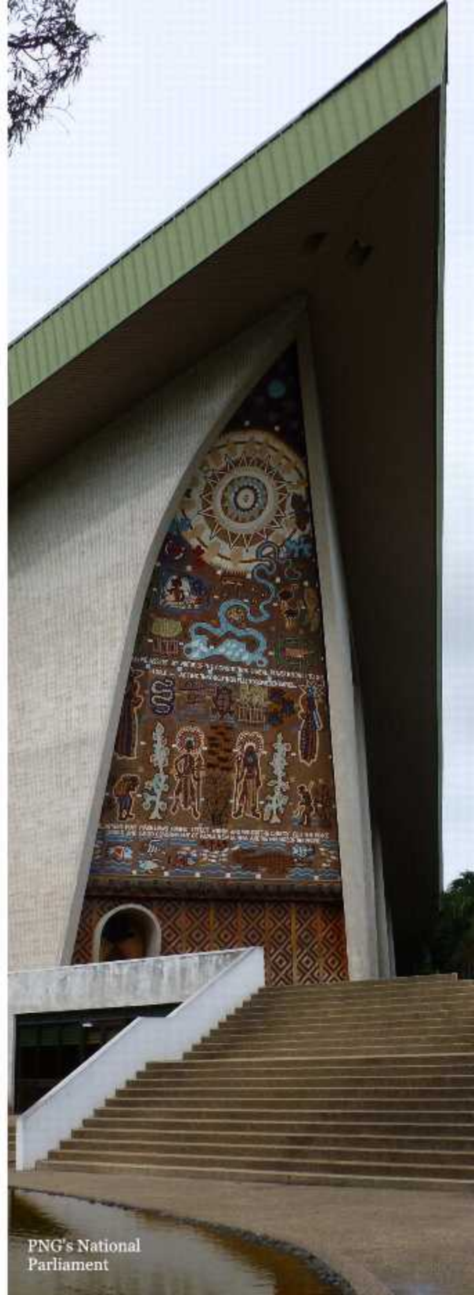
PNG's National Parliament

In a political landscape marked by opaque transactions, systemic and systematic corruption, the breakdown in due process and managerial oversight, as well as almost total immunity for known ring-leaders, it is perhaps not surprising to learn that one of the country's most infamous departments has failed to follow through on PAC recommendations, or that the NEC has permitted this to occur. For Paga Hill's residents, this failure to enact forfeiture proceedings, or further scrutinise the developer, has generated the situation where their community, livelihood and security are now under serious threat.