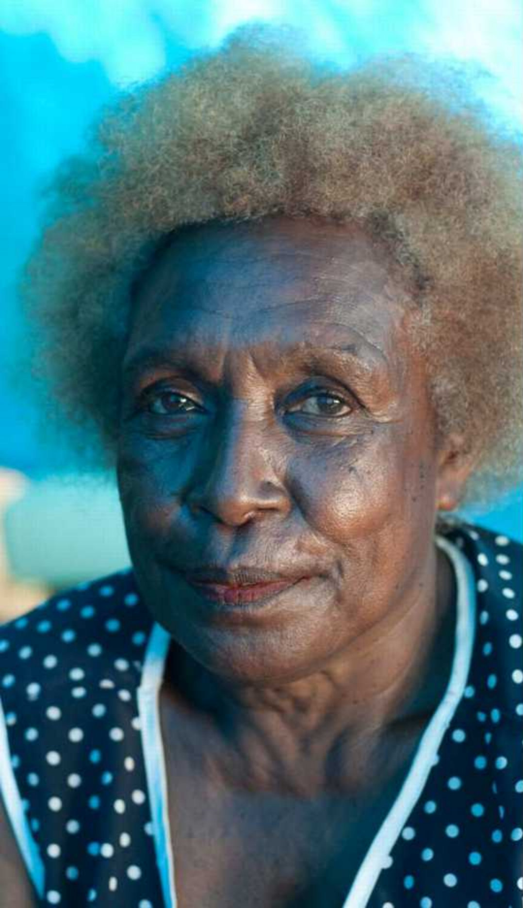
Part 2 - The Chequered History of Portion 1597