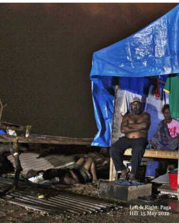
Left & Right: Paga Hill 15 May 2012