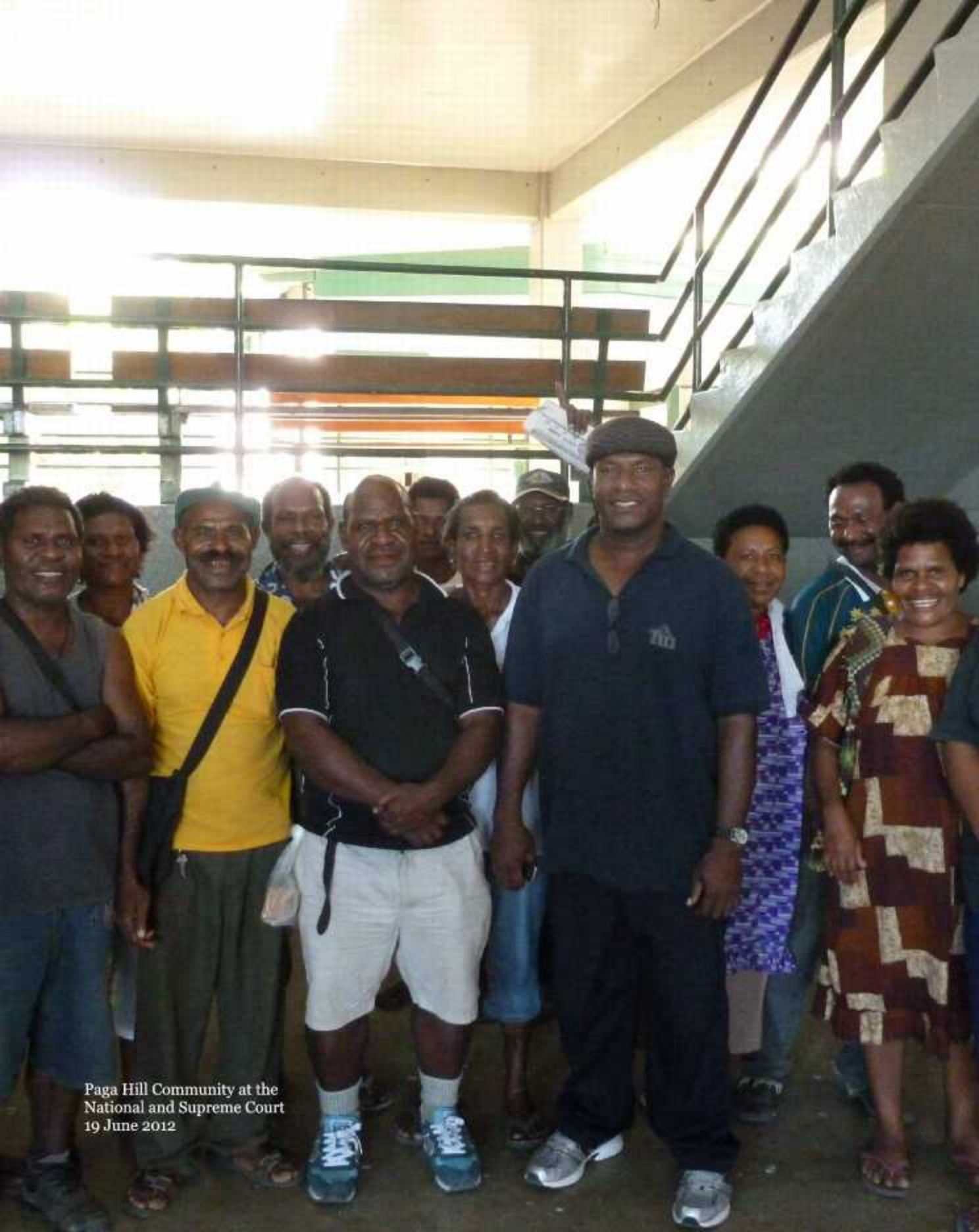
Paga Hill Community at the National and Supreme Court 19 June 2012