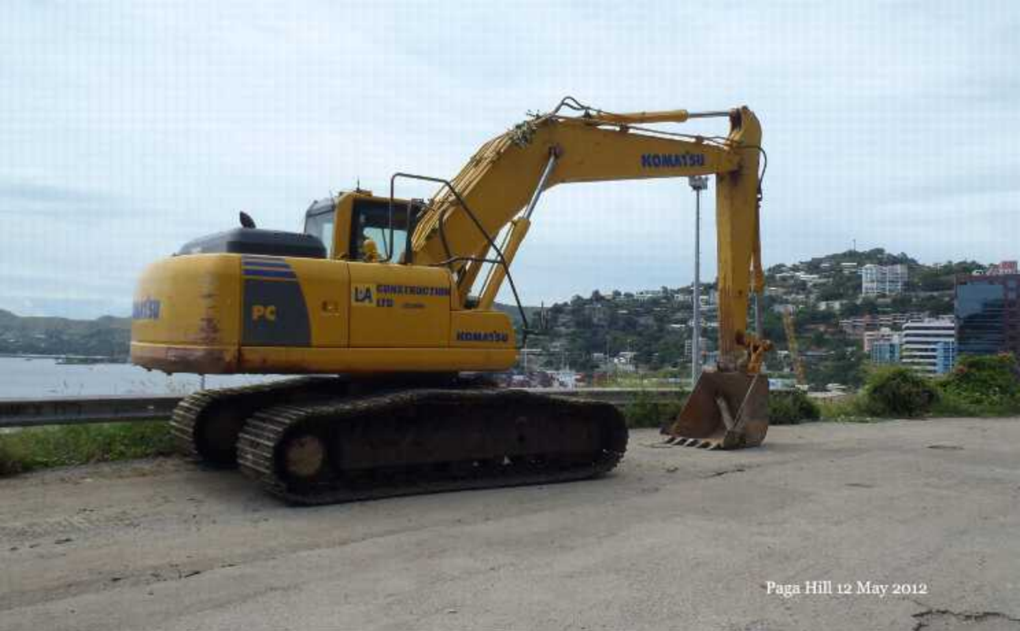
Paga Hill 12 May 2012

The following report traces the origins, and impact, of this state-sanctioned demolition. It will begin by examining Paga Hill's chequered administration by the Department of Lands and Physical Planning (Lands Department); a government agency with a documented reputation for corruption, serial mismanagement and impunity. Attention will then be turned to a web of companies intimately connected with the developer. These companies, it will be revealed, have featured in no less than nine official inquiries into corruption and public mismanagement. Nevertheless, the developer