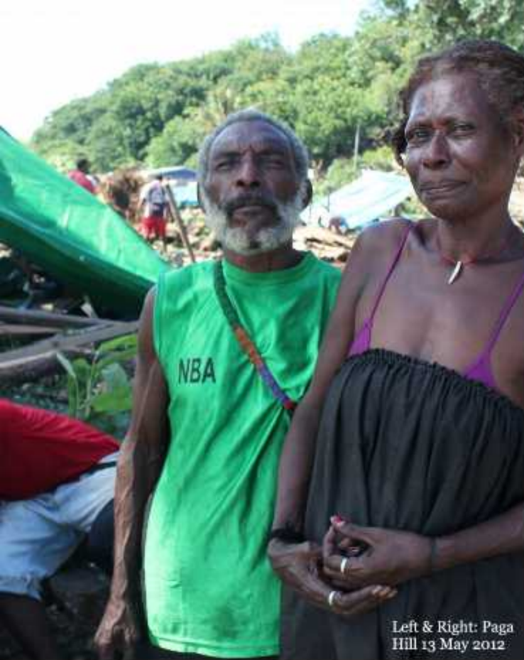
Left & Right: Paga Hill 13 May 2012