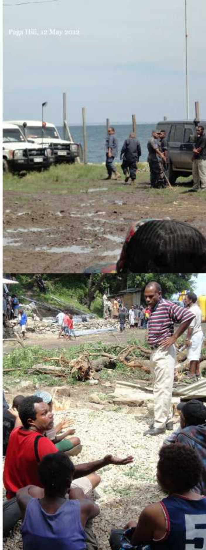
Paga Hill, 12 May 2012

As community leaders waited at the National Court, ten Royal Papua New Guinea Constabulary (RPGNC) land cruisers descended down the steep dirt road into Paga Hill. Armed with assault rifles, machetes and