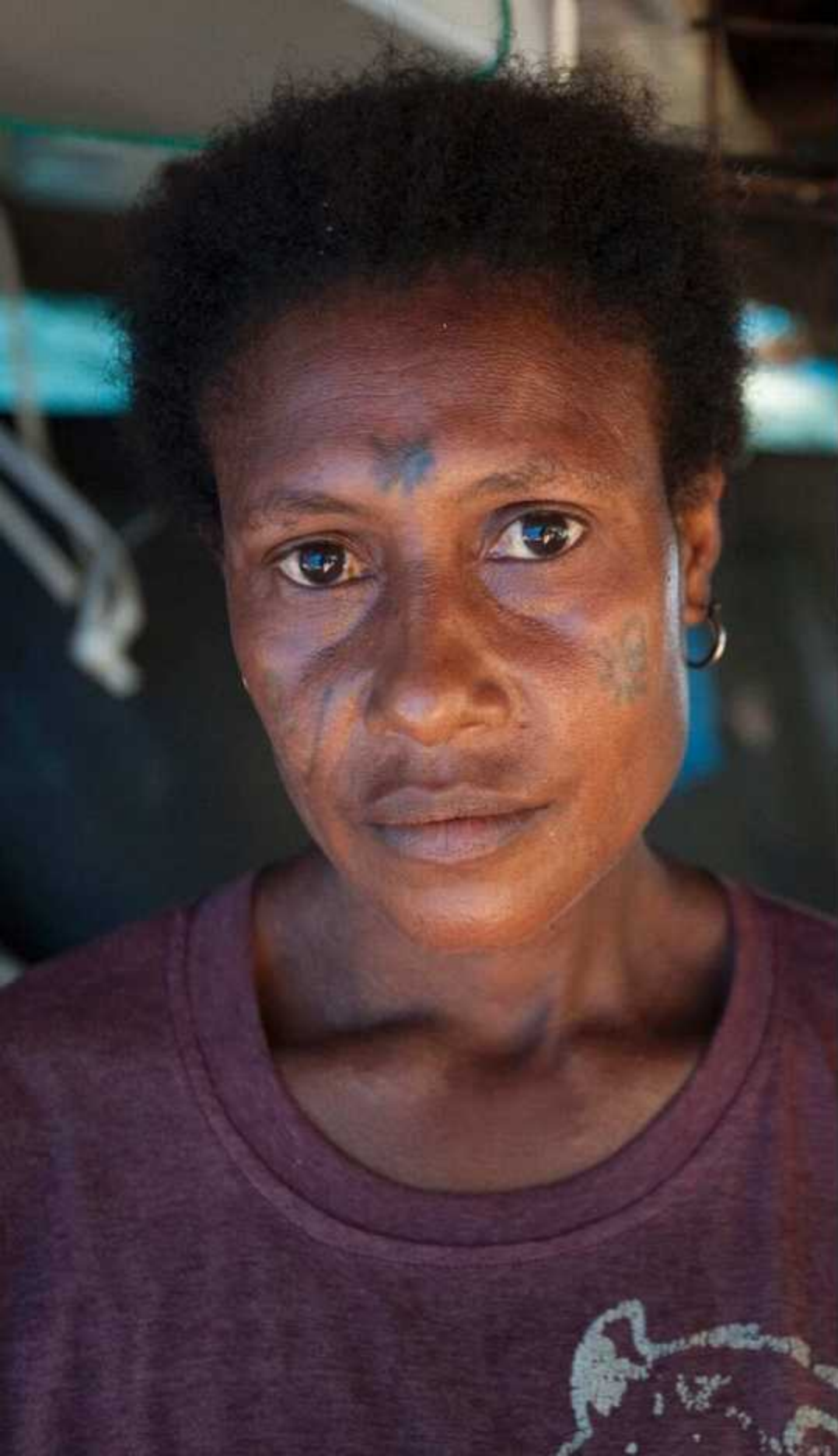
Part 4 - The 12 May Eviction