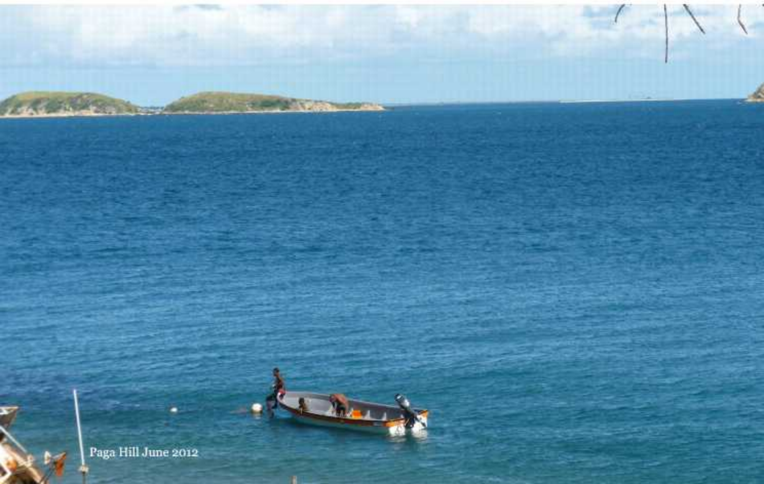
Paga Hill June 2012