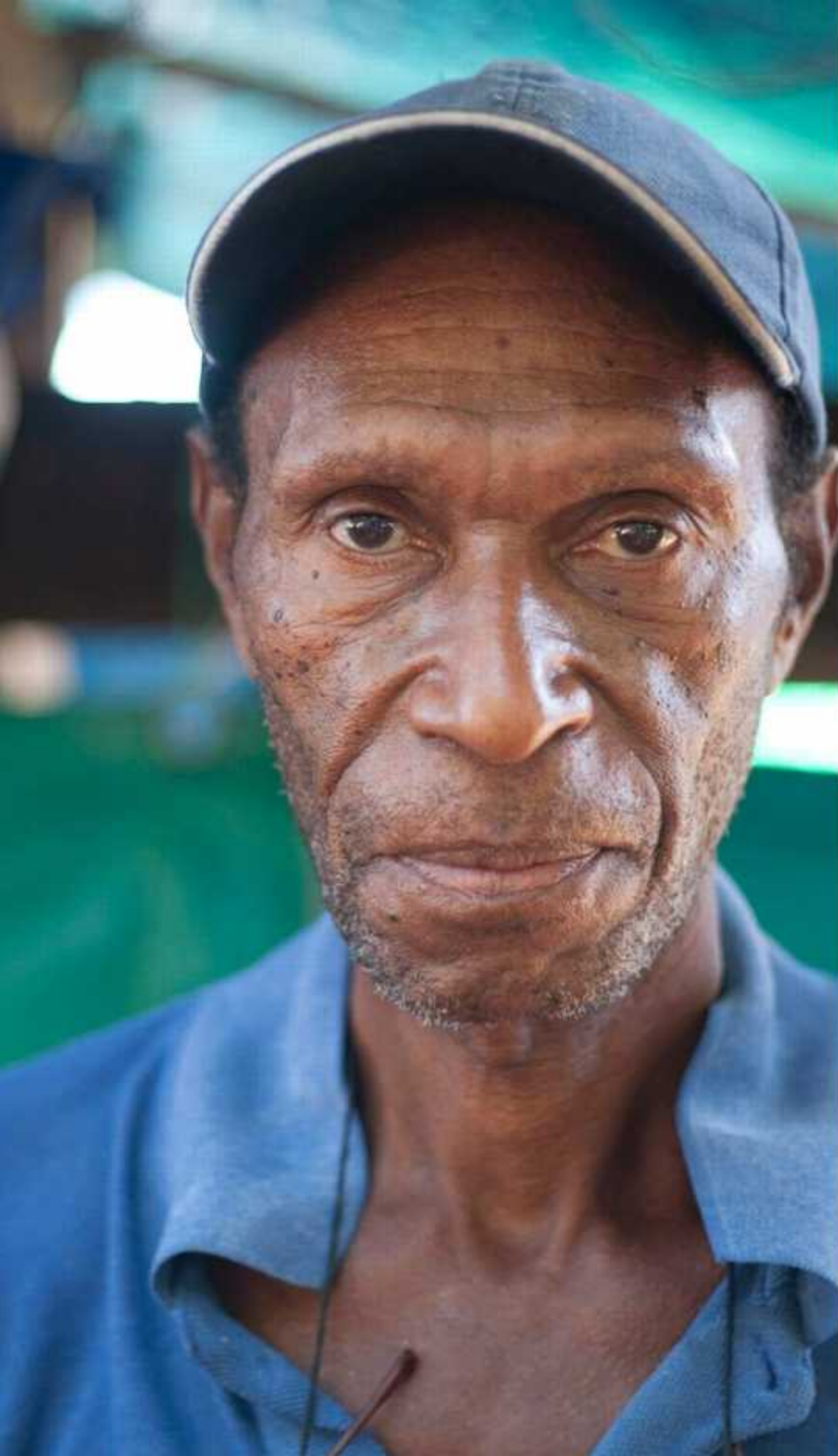
Part 3 - Scrutinising PHDC and the Lands Department